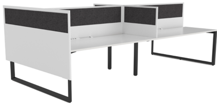
4 User Workspace with integrated cable duct with Breathe Slate Grey Screen Dividers

Cable trays - system includes desk to desk bridges, power/ data mounting points (inside the tray or on the vertical face) and cable snakes to the desktop